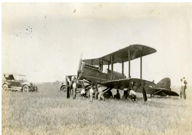
Elmhurst Airport, circa 1929. M83.36.11

With the approach of World War II, the Civil Aeronautics Administration created a program that was a cooperative effort between colleges that offered ground study and airports that offered flight instruction in order to fast-track civilians into military service. Both Elmhurst College and Wheaton College partnered with Elmhurst Airport in this program.